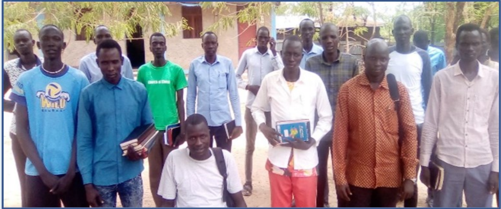
Photo taken at the Gambella compound.